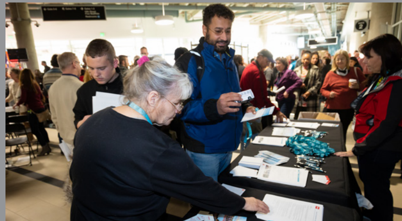
Promotional items and large graphic images honored the past of Civic Center Station while celebrating the progress of transit in the Denver metro area.